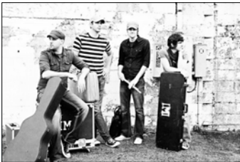
A Night of Worship with the Museum Band 6:00 pm in the Upper Room

January 3..... No youth group January 10..... Game Night for both Middle & High School January 17..... 7th-12th Grades—